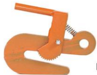
Safety Pipe Hooks SPH-03

Designed to grip pipe or casing for hands free operation.