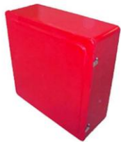
Fire Hose Cabinet FHC-300