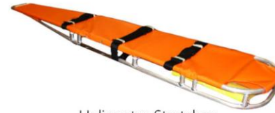
Helicopter Stretcher B-206