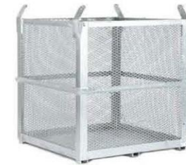
Rigid Cargo Basket 343

The DB-1 Derrick Basket is made for lifting personnel with a lightweight basket and retractable lifeline attached to fall protection harness.