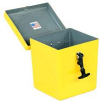
Utility Box UB-1