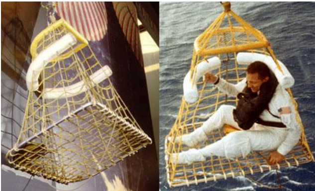
Apollo 13 호 우주인 Jack Swigert 지구 귀환 BPC Rescue Net으로 구조 중