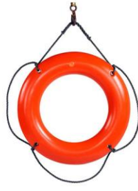
USCG Life Ring Buoy A-301