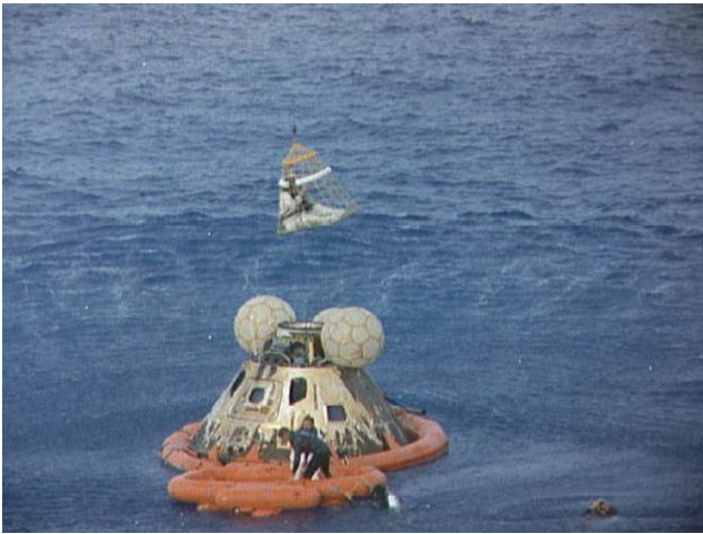
Apollo 13 호 우주인 Jack Swigert 지구 귀환 BPC Rescue Net으로 구조 중