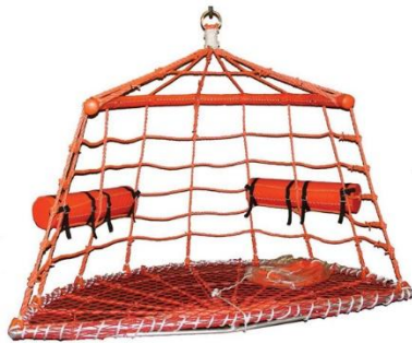
Boat Rescue Net X-544

The BPC X-544 is a boat davit or crane launched rescue system. Safe and effective for retrieving man overboard operations with the option of not putting a rescue swimmer in harm's way.