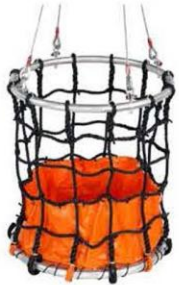
Personnel Work Basket PWB-2

The collapsible work basket is a lightweight man basket for applications where OSHA requirement is not applicable.