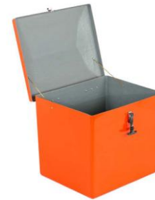
Life Preserver Box LPB-5