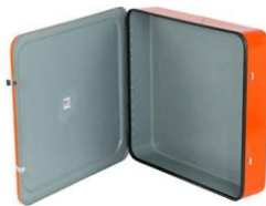
Ring Buoy Box RBB-30