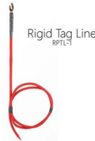
Rigid Tag Line RPTL-1