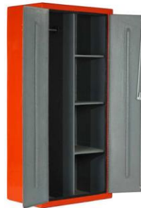
Storage Locker SL-1