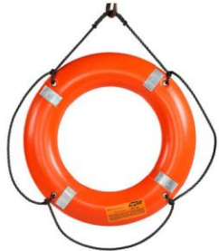
SOLAS Life Ring Buoy A-301S