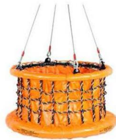
Collapsible Cargo Basket X-8CB

The collapsible work basket is a lightweight man basket for applications where OSHA requirement is not applicable.