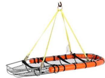
Wire Stretcher S-1