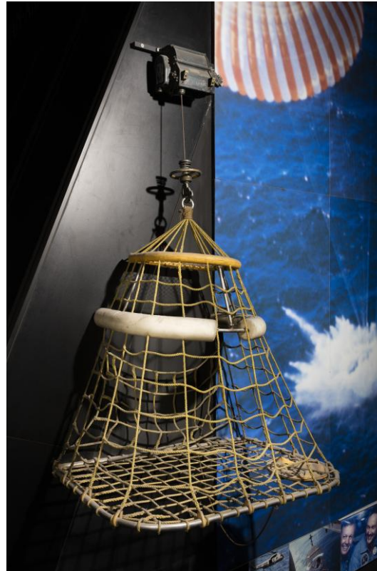
Apollo 8 호 우주인 지구 귀환 구조용 BPC Rescue Net (박물관 전시중)