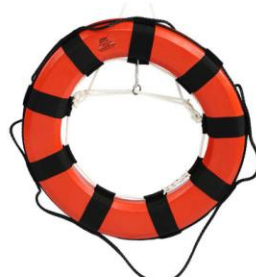
Rescue Ring RR-30